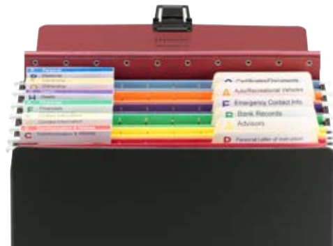
Place all the assembled folders inside the case. Now you are ready to start collecting the contents to fill your files.

Assembly video and templates available @ www.smead.com/LifeDocumentsOrganizer