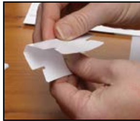
Fold into 3-D tabs.