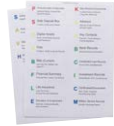
24 pre-printed oversized folder labels