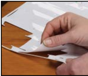
Remove plastic hanging folder tabs from perforated sheet.