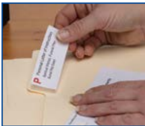
Remove and apply pre-printed oversized folder labels to the 24 manila file folders.