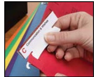
Slide tab into hanging folder.