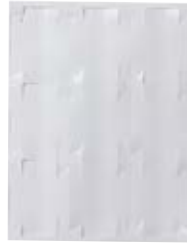
9 Quick-Fold Tabs (1 sheet)