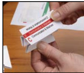
Apply Quick-Fold labels to tabs.