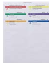
6 pre-printed Quick-Fold Tab labels